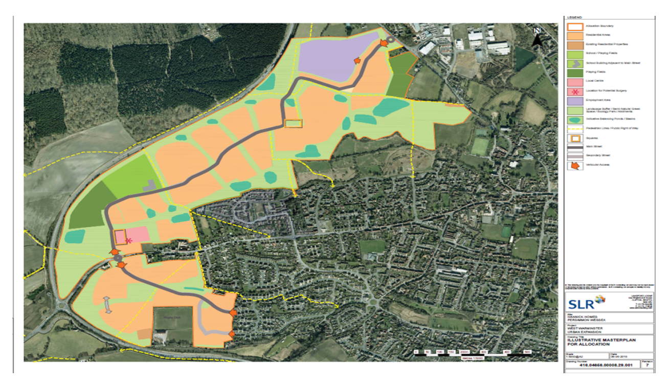
9.16 <u>Housing Supply</u> – Given the plan policy implications, the importance which is attached to delivering housing on the strategically allocated sites cannot be over emphasised, especially at the present time when the Council cannot demonstrate a 5-year housing land supply. Delaying or refusing this application could have significant impacts in terms of the Council's 5-year housing land supply, as well as opening the door further to speculative non-plan led developments which the Council may not be able to resist whilst NPPF paragraph 49 is engaged.